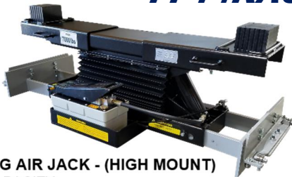
RAJ-7K-H IDEAL, 7K ROLLING AIR JACK - (HIGH MOUNT)